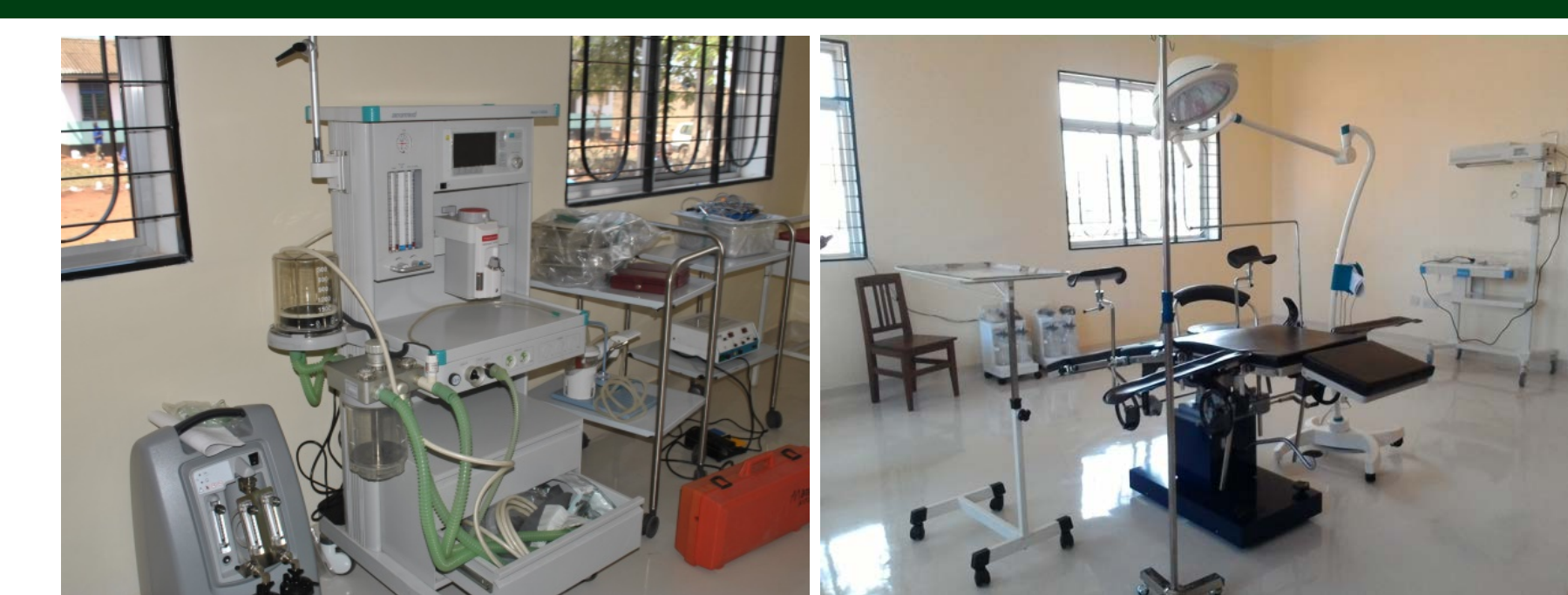
Left: Rear view, new OT. Above: Equipment for new OT